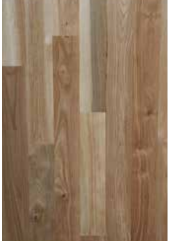
3RD GRADE (COMMON) This floor is more than 50% red with many variations. Open knots, mineral stains, machine burns and worm holes are allowed. Average board length 23".