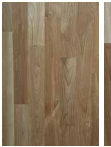
SELECT GRADE This floor is more than 75% red with some mineral stains. This is our cleanest grade allowing only minor pin knots and mineral stains. Average board length 39".